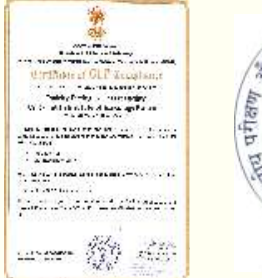
GLP certificate for toxicity studies