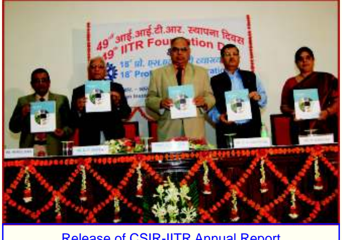
Release of CSIR-IITR Annual Report