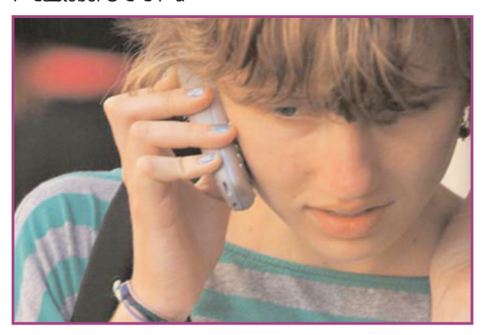
In July 2008 market research firm MultiMedia Intelligence reported that more than 16 million U.S. teens use cell phones.

[Environmental Health Perspectives Volume FF Î NÊumber F€OnctoberG€€Ìá